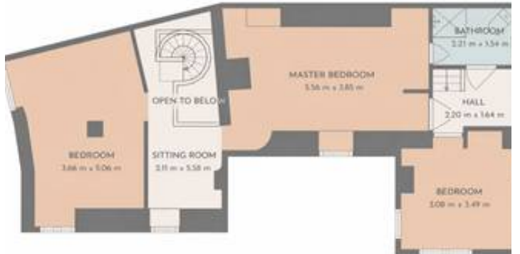
TOTAL: 136 m 2 Floor 1: 69 m 2 , 1st Floor: 67 m 2 EXCLUDED AREAS: VERANDA: 24 m 2 , OPEN TO BELOW: 1 m 2 , WALLS: 11 m 2