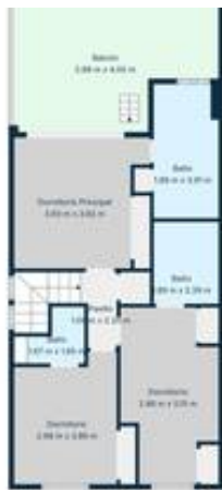
TOTAL: 216 m2 1. PLANTA 75 m2, 2. PLANTA 75 m2, 3. PLANTA 63 m2, 4. PLANTA 0 m2 ÁREAS EXCLUIDAS: PORCHE: 22 m2, PATIO: 91 m2, PATIO: 125 m2, BALCÓN: 10 m2, GARAJE ABIERTO: 34 m2, AZOTEA: 65 m2, MUEBOS: 19 m2