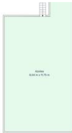
TOTAL: 216 m2 1. PLANTA 75 m2, 2. PLANTA 75 m2, 3. PLANTA 63 m2, 4. PLANTA 0 m2 ÁREAS EXCLUIDAS: PORCHE: 22 m2, PATIO: 91 m2, PATIO: 125 m2, BALCÓN: 10 m2, GARAJE ABIERTO: 34 m2, AZOTEA: 65 m2, MUEBOS: 19 m2