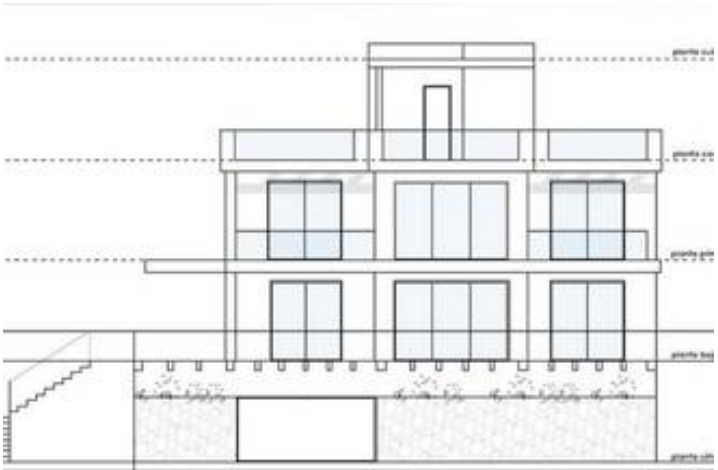
ALZADO ESTE ESCALA 1/100