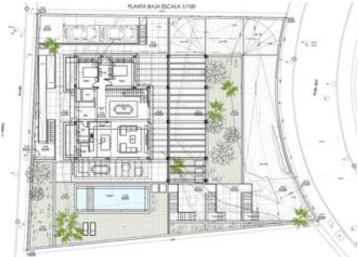
PLANTA BAJA ESCALA 1/100