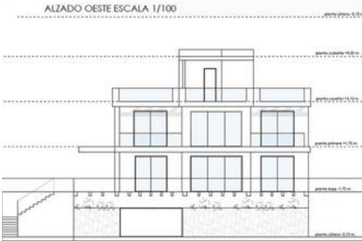
ALZADO OESTE ESCALA 1/100