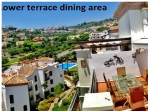
lower terrace dining area