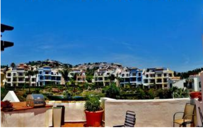
View from roof terrace to the rear