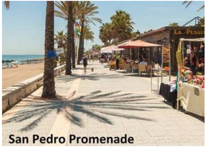
San Pedro Promenade