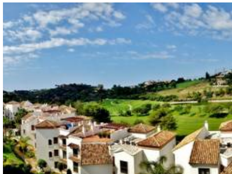
90 sq. mtrs. of rooftop solarium