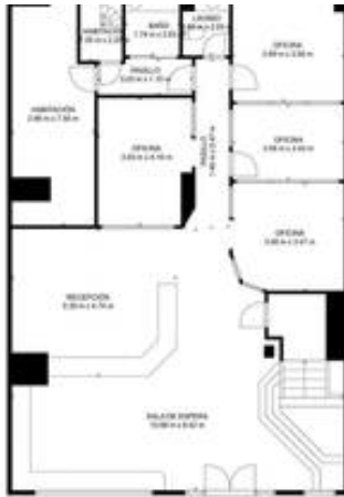
TOTAL 287 M 2 1. RUANG: 171 M 2 2. PLANTING: 120 M 2 3. LAINNY: 96 M 2