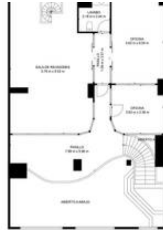
TOTAL 287 M 2 1. RUANG: 171 M 2 2. PLANTING: 120 M 2 3. LAINNY: 96 M 2