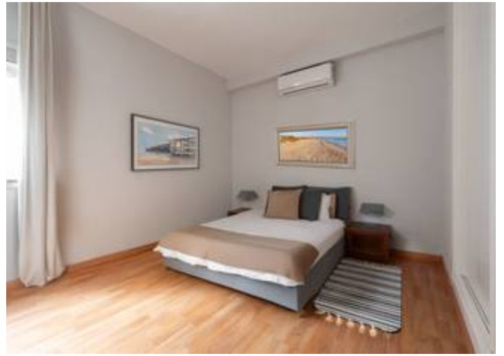
This image is a simulation modified with AI