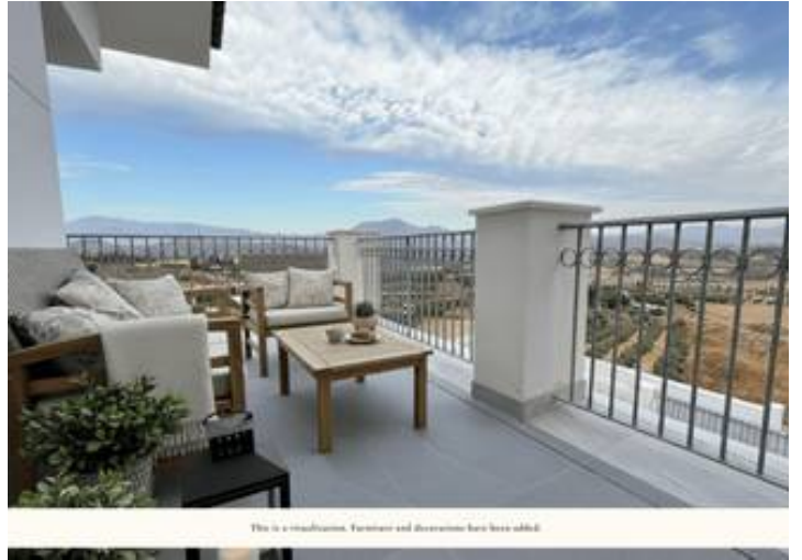
This is a visualization. Furniture and decoration have been added.