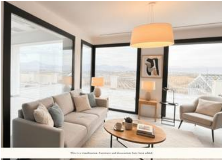
This is a visualization. Furniture and decoration have been added.