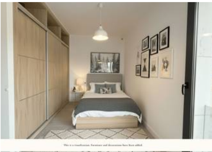
This is a visualization. Furniture and decoration have been added.