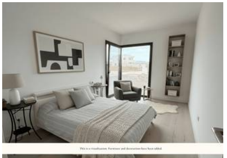
This is a visualization. Furniture and decoration have been added.