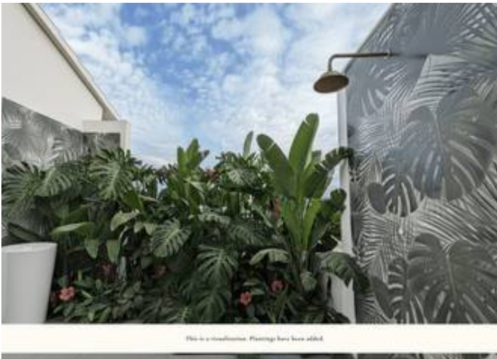
This is a visualization. Plantings have been added.