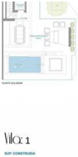
Vila: 1 SUP. CONSTRUIDA