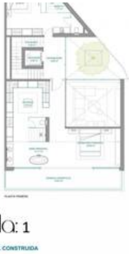
Vila: 1 SUP. CONSTRUIDA