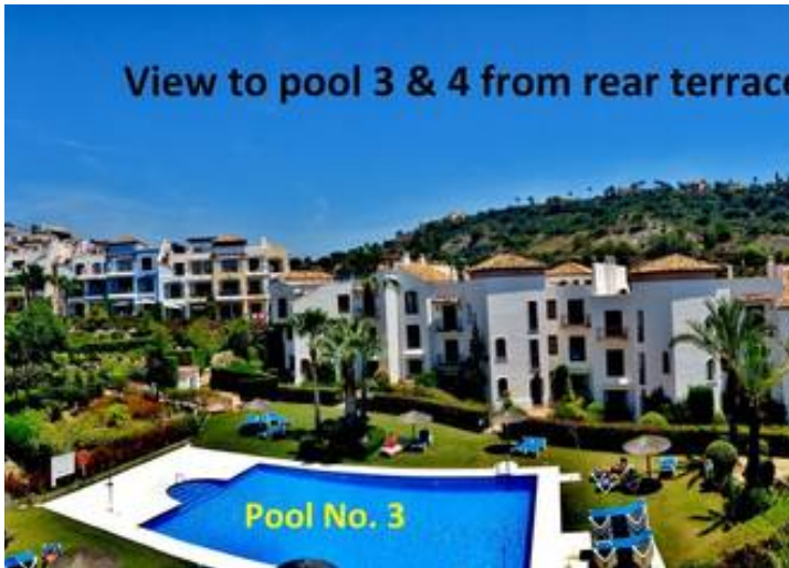
View to pool 3 & 4 from rear terrace