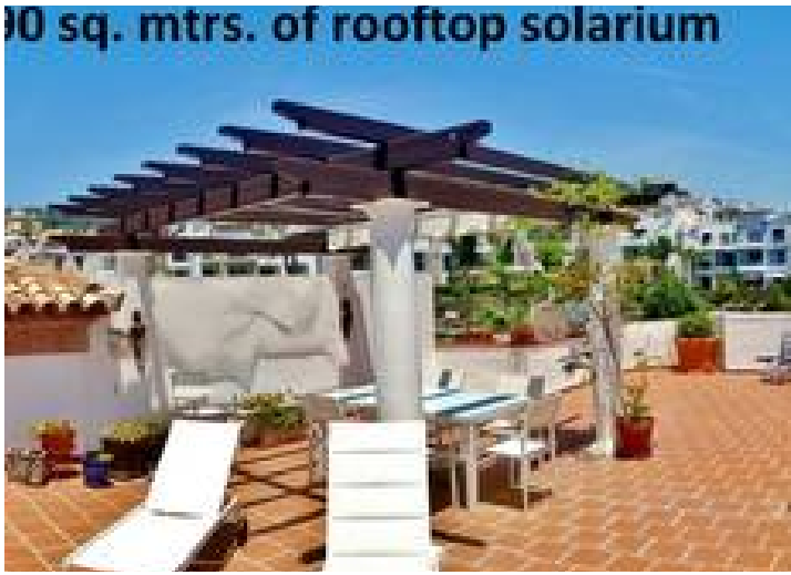
90 sq. mtrs. of rooftop solarium