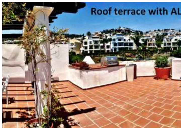
Roof terrace with AL