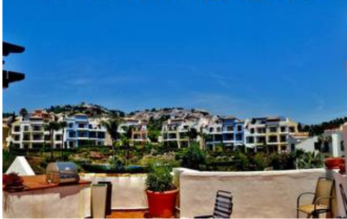
View from roof terrace to the rear