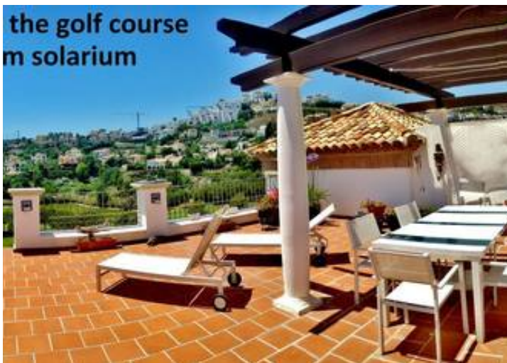
the golf course m solarium